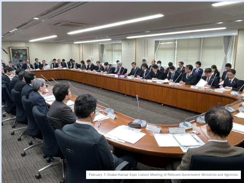
February 7: Osaka-Kansai Expo Liaison Meeting of Relevant Government Ministries and Agencies