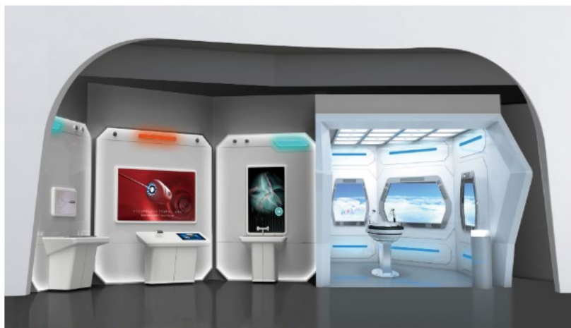
▲PASONA NATUREVERSE 『未来の医療』展示イメージ

https://www.pasonagroup.co.jp/news/index112.html?itemid=5284&dispmid=798